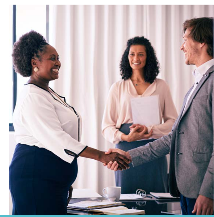
Generally, if approved, vendors are only allowed to pay for the registration fees.

Speak with your manager or immediate supervisor, or reach out to Compliance and Ethics for guidance.